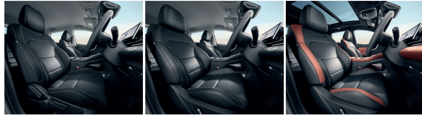
1.5TD Executive Black Fabric Seats