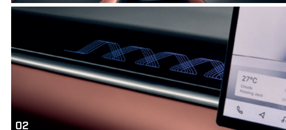
01 Dual Tone Interior 02 72-Colour Rhythmic Ambient Light 03 Premium Soft Touch Interior 04 Floating Floor Console 05 Full LED Headlamps with Daytime Running Lamps 06 Front Welcome Lamps 07 18" Alloy Wheels 08 Sporty Spoiler 09 Full LED Rear Tail Light Bar 10 Quad Exhaust Tailpipes